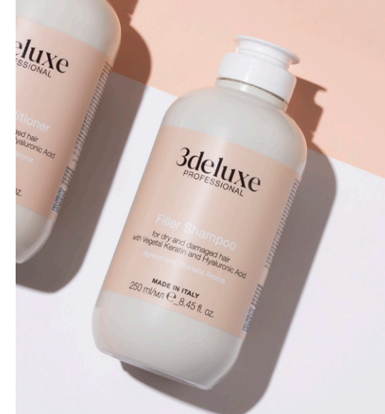
Filler Shampoo for dry and damaged hair with Vegetal Keratin and Hyaluronic Acid Apricot and Prunella Fragrance

IT. Shampoo rimpolpante e illuminante. Formula a pH acido. Deterge delicatamente e aiuta a rivitalizzare e rafforzare la fibra capillare, controllando l'effetto crespo. Modo d'uso: applicare sui capelli bagnati, emulsionare e risciacquare. EN. Plumping and illuminating shampoo. Acid pH formula. It gently cleanses and helps to revitalize and strengthen the fiber structure for frizz-free hair. Directions: apply to wet hair, massage gently and rinse. ES. Champú rellenador, alisador y reestructurante. Formula de pH ácido. Limpia delicadamente revitalizando y fortaleciendo la fibra capilar, controlando el efecto de frizz. Instrucciones: aplique sobre el cabello mojado, masajee suavemente y enjuague.