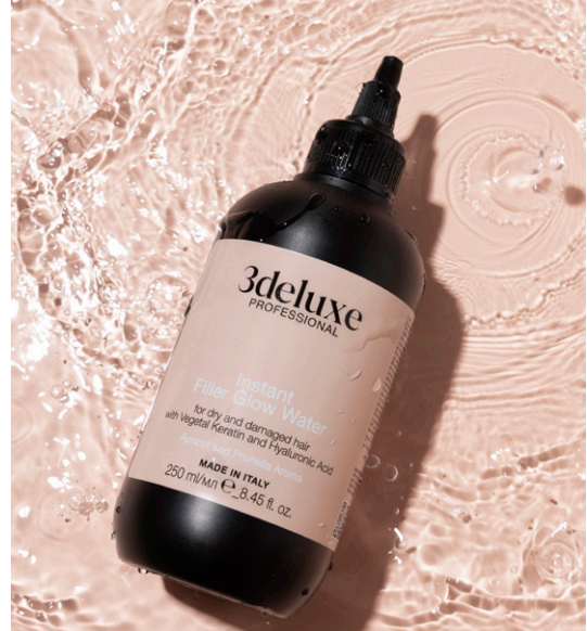
Instant Filler Glow Water for dry and damaged hair with Vegetal Keratin and Hyaluronic Acid Apricot and Prunella Fragrance

IT. Dona in pochi secondi una chioma fluida, super lucente e straordinariamente leggera. Modo d'uso: applicare sui capelli umidi, massaggiare, quindi risciacquare. EN. In a few seconds hair is fluid, super shiny and extremely lightweight. Directions: apply to towel-dried hair, massage, then rinse. ES. Brinda en pocos segundos un cabello fluido, super brillante y sorprendentemente ligero. Instrucciones: aplicar en cabello húmedo, masajear y enjuagar.