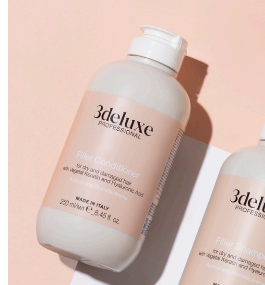
Filler Conditioner for dry and damaged hair with Vegetal Keratin and Hyaluronic Acid Apricot and Prunella Fragrance

IT. Balsamo rimpolpante e illuminante. Nutre intensamente i capelli rivitalizzando e rafforzando la fibra capillare, controllando l'effetto crespo. Modo d'uso: applicare sui capelli tamponati. Lasciare in posa 10 minuti, quindi risciacquare bene. EN. Plumping and illuminating conditioner. It intensely nourishes the hair by revitalizing and strengthening the fiber structure, for frizz-free hair. Directions: apply to towel-dried hair. Leave on for 10 minutes, then rinse well. ES. Bálsamo rellenador y reconstituyente. Nutre intensamente los cabellos revitalizando y fortaleciendo la fibra capilar, controlando el efecto frizz. Instrucciones: aplicar después del champú, secar los cabellos con una toalla y peinar. Dejar actuar 10 minutos. Enjuagar.