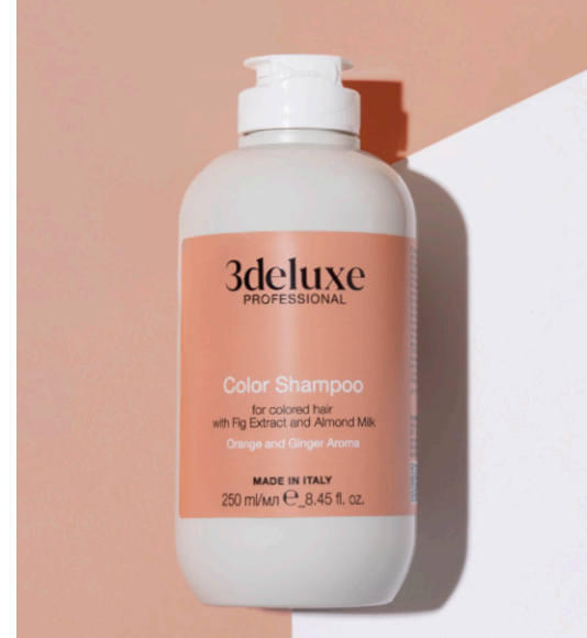
Color Shampoo for colored hair with Fig Extract and Almond Milk Orange and Ginger Fragrance

IT. Shampoo protezione colore e luminosità per capelli colorati, con latte di mandorla dolce e fico. Modo d'uso: applicare sui capelli umidi, emulsionare e risciacquare.