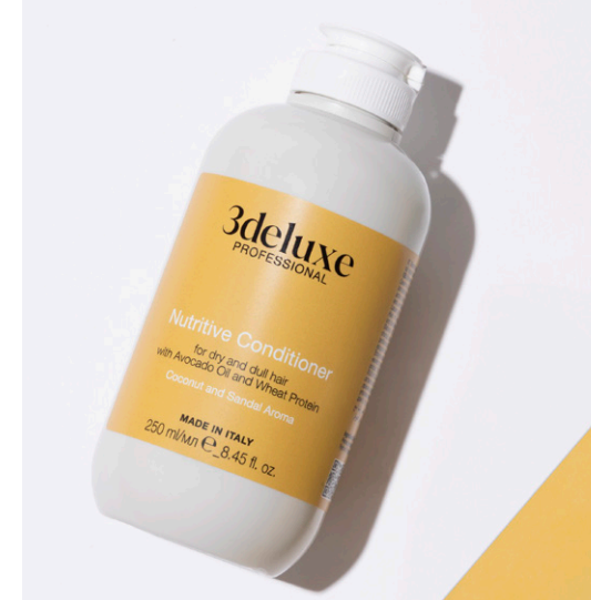
Nutritive Conditioner for dry and dull hair with Avocado Oil and Wheat Protein Coconut and Sandal Fragrance

IT. Balsamo nutriente intenso per capelli secchi , con olio di avocado e proteine del grano. Modo d'uso: applicare dopo lo shampoo sui capelli umidi e pettinare. Lasciare agire 2-3 minuti. Risciacquare.