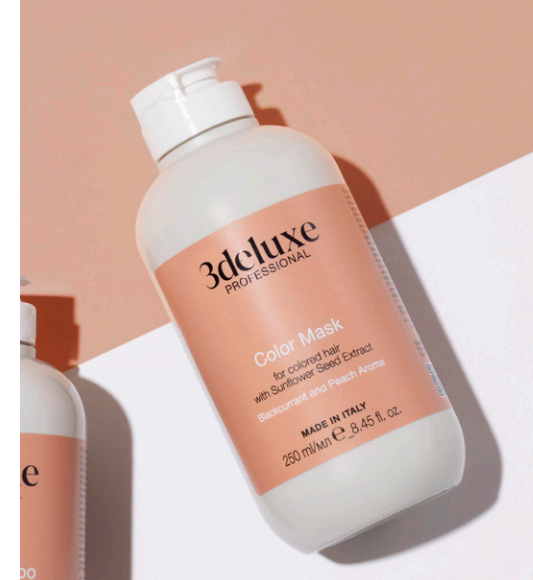
Color Mask for colored hair with Sunflower Seed Extract Blackcurrant and Peach Fragrance

IT. Maschera protezione colore per capelli colorati, con estratto di semi di girasole. Modo d'uso: applicare dopo lo shampoo sui capelli umidi e pettinare. Lasciare agire 2-3 minuti. Risciacquare.