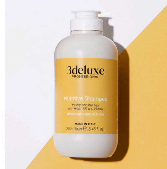
Nutritive Shampoo for dry and dull hair with Argan Oil and Honey Vanilla and Magnolia Fragrance

IT. Shampoo nutriente per capelli secchi , con olio d'argan e miele. Modo d'uso: applicare sui capelli bagnati, emulsionare e risciacquare.